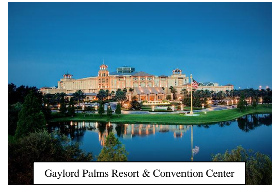
Gaylord Palms Resort & Convention Center

Thirty-six delegates from North Carolina attended the 33rd Southeast Regional Conference of The Delta Kappa Gamma Society