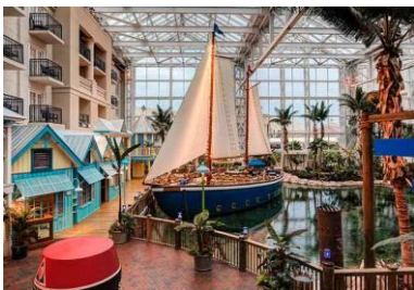
Sunset Sam's Restaurant

Thursday afternoon the NC Delegation had their picture taken. Immediately after, the members of the delegation made their way across the atrium to Sunset Sam's Restaurant where the delegation had a delightful meal together.